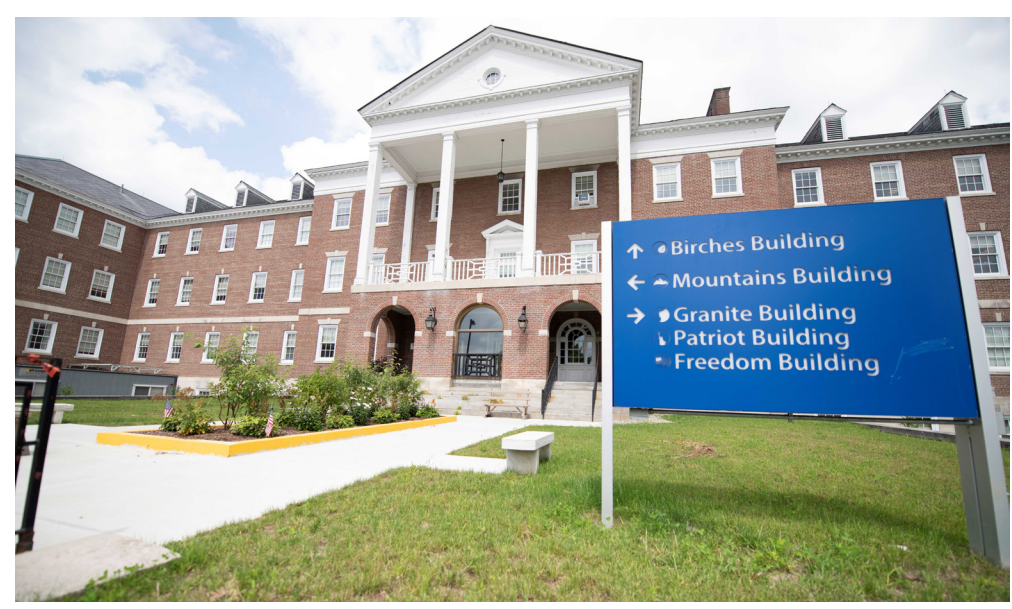
White River Junction VA Medical Center

The VA White River Junction Healthcare System (VAWRJ) provides outstanding health care, trains future health care providers, and conducts important medical research. VAWRJ provides health care services at eight locations in Vermont as well as northwestern New Hampshire.