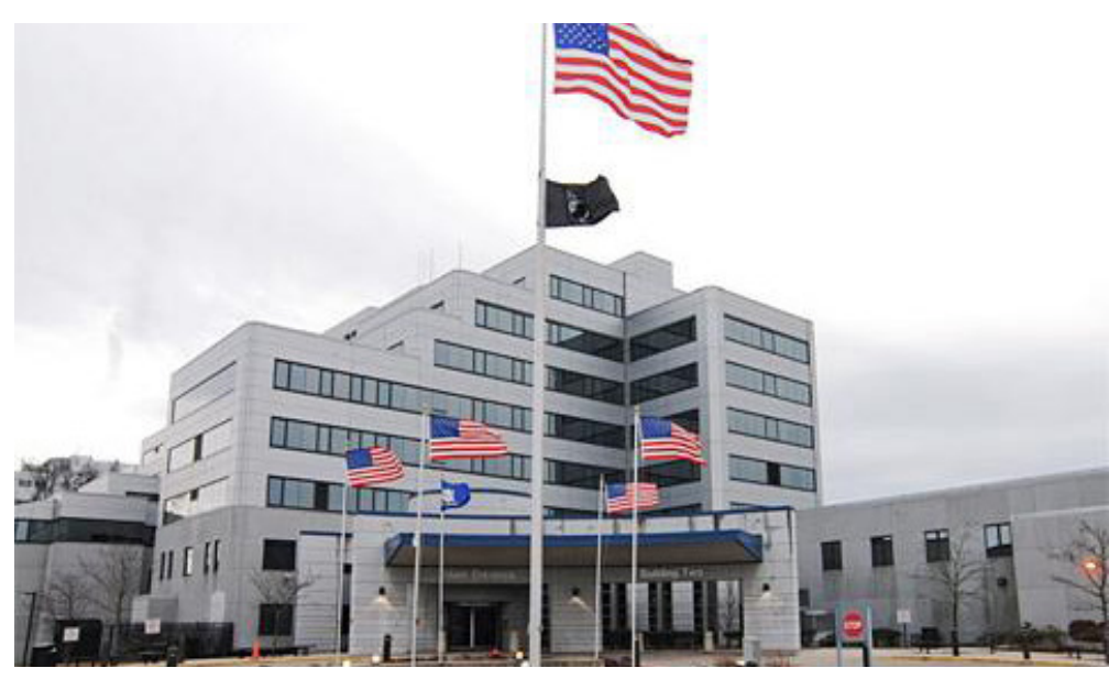
West Haven VA Medical Center

The VA Connecticut Healthcare System proudly serves Veterans in Connecticut and southern New England at 10 locations. VA Connecticut provides high-quality care, trains the next generation of medical providers, and conducts research to improve the lives of Veterans and all Americans through the use of discovery and innovative practices.