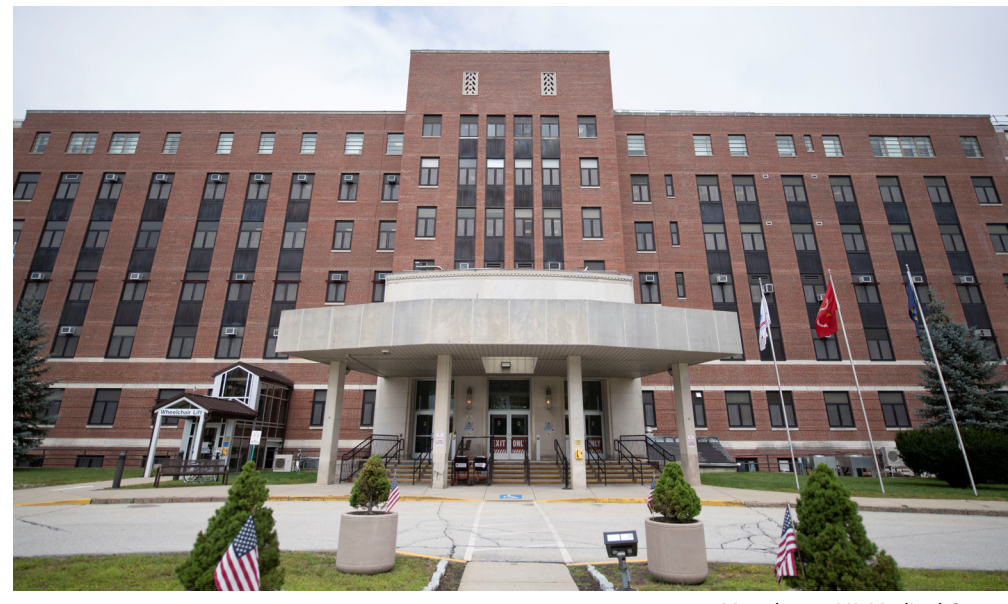
Manchester VA Medical Center

The Manchester Veterans Administration Hospital, now known as the Manchester VA Medical Center, was completed in 1950 as part of the post-World War II initiative of the Veterans Administration to provide modern medical care and facilities to Veterans of the war. To this day, we are committed to providing access to excellent health care for Veterans. That includes our main campus and the inclusion of four Community Based Outpatient Clinics in Conway, Portsmouth, Somersworth, and Tilton. We have health care services at the Brady Sullivan annex as well as telehealth opportunities that improve equitable access to health care benefits for all Veterans.