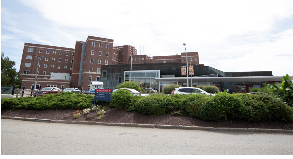
VA Providence Healthcare System

The VA Providence Healthcare System (VAPHS) provides Veterans residing in Rhode Island, southeastern Massachusetts and parts of eastern Connecticut with highquality care across the full range of patient services and with stateof-the-art technology.