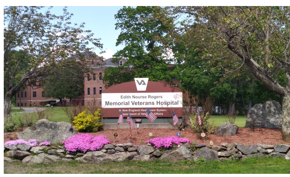
Edith Nourse Rogers Memorial Veterans' Hospital

Our mental health programs include vocational, peer, homeless and outpatient mental services, which are nationally recognized.