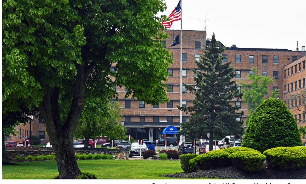
Brockton campus of the VA Boston Healthcare System

VA Boston Healthcare System consists of main campuses in Brockton, Jamaica Plain, and West Roxbury with VA clinics in Lowell, Quincy, Framingham, Plymouth, and Boston.