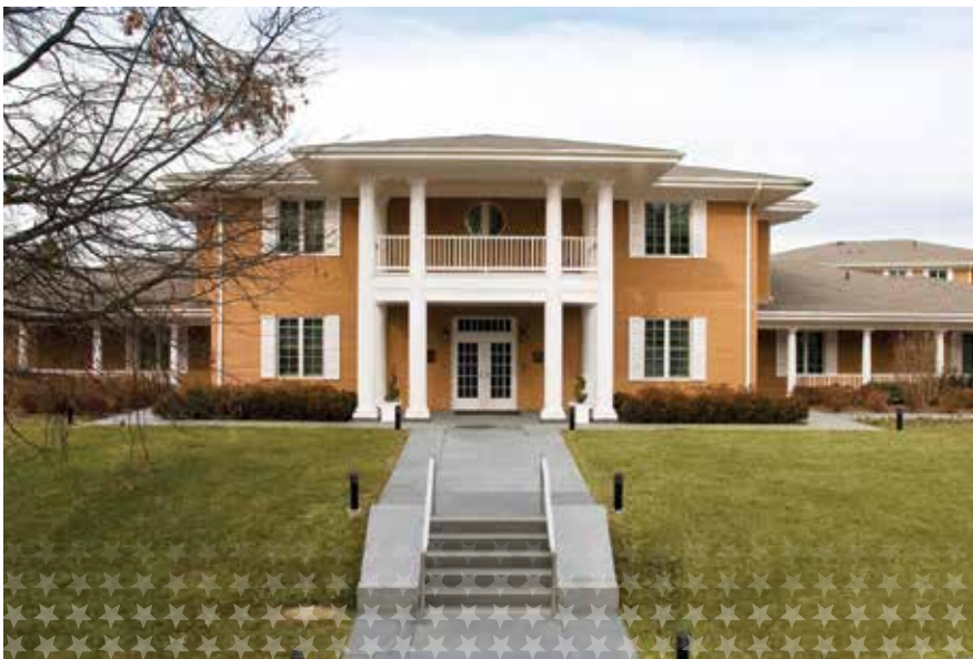
Once completed, the new Fisher House Connecticut at the West Haven VAMC will resemble the Walter Reed Army Medical Center Fisher House (pictured here) in Washington, D.C.

When a Veteran is receiving care at a VA medical facility, it's important to have loved ones close by to offer support and encouragement. But such a long stay can come with a hefty price tag. Fisher Houses provide housing, free of charge, to Veterans' families. This helps ease their financial burden and bring some peace of mind. Now, the first Fisher House in Connecticut will come soon to the West Haven VA campus.